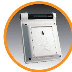
Back stand with hanging support.