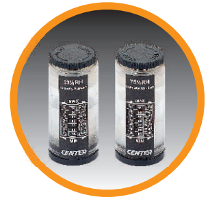
33%RH / 75%RH Humidity Standard (OPTIONAL)

* The specifications and other information in this catalogue are subject to change without prior notice.