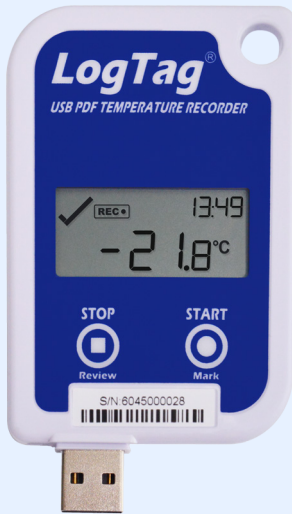
Rated Absolute Accuracy