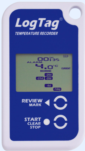
Rated Absolute Accuracy